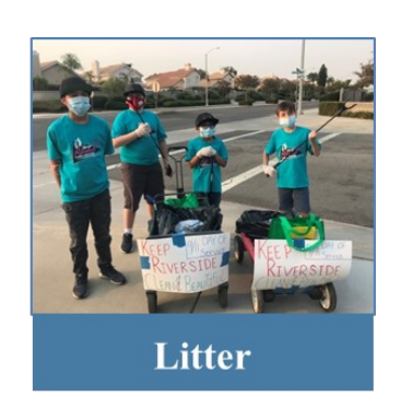
"Love Your Neighborhood" cleanups were done with family members.