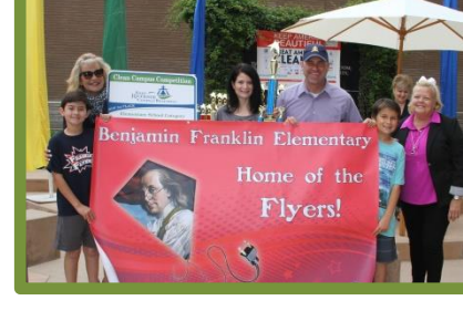
Ben Franklin Elementary School