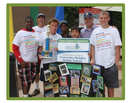
University Heights Middle School